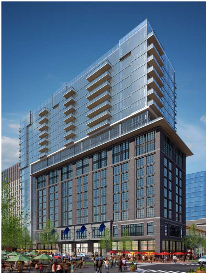
Pike and Rose Block 6, Bethesda, Md.

WCS Construction has also broken ground on New Jersey at H , 800 New Jersey Avenue, SE an 11-story luxury apartment building on top of a Whole Foods supermarket located one block from the Navy Yard Metro station with direct views of the U.S. Capitol.