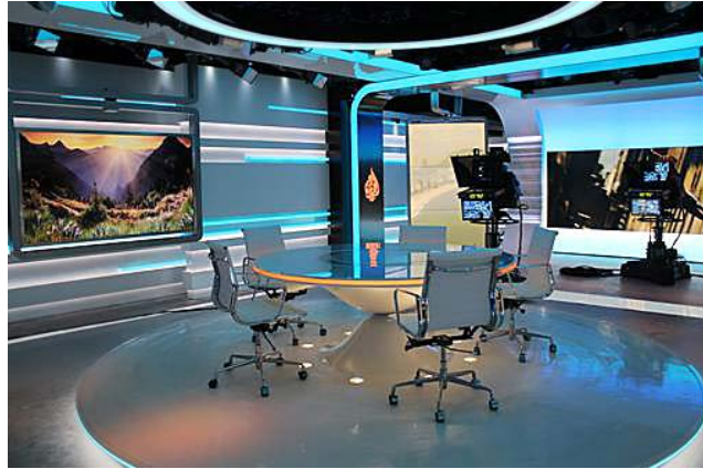
Al Jazeera's Washington, DC Bureau, Washington, DC

multiple edit suites, and a single news studio. Coordination with Al Jazeera's systems integrator and set designer was a challenging yet crucial part of getting the space built-out to meet Al Jazeera's construction timeline. The building remained occupied and operational with its current tenants throughout construction.