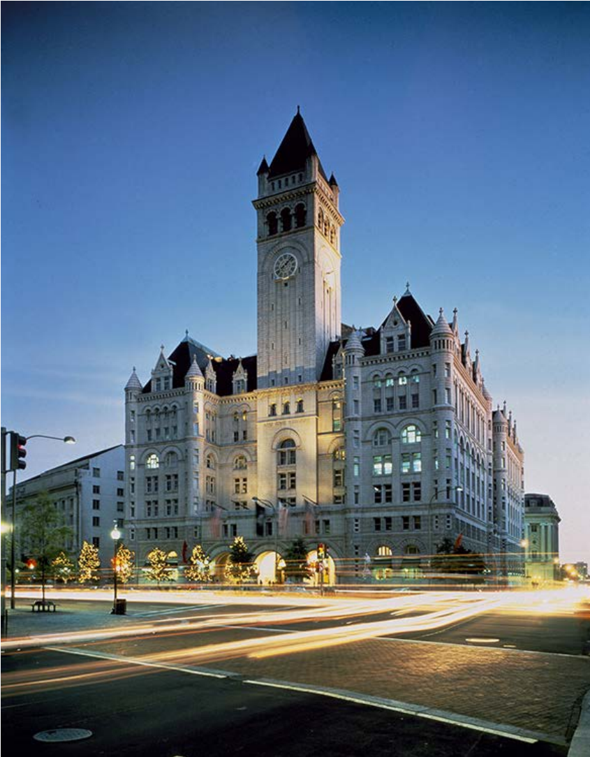
Trump International Hotel, Washington, DC

GCS-SIGAL, LLC celebrated the groundbreaking of the Duke Ellington School of the Arts in Washington, DC. This Design-Build project will expand the historic facility from 176,000 square feet to approximately 295,000 square feet in order to accommodate its current and future needs. Named after composer/musician and DC-native Edward Kennedy “Duke” Ellington, the School of the Arts guides students through a full academic course of study and a pre-professional art major. The school has received an Exemplary School designation since 2012 and, according to its website, ensures “that our students are prepared for post-secondary education