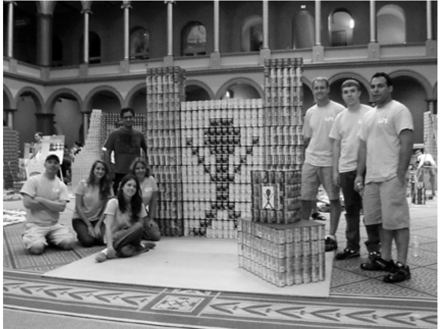
GPI employees assembled their installation into an airport body scanner at this year's CANstruction.

GPI has been supporting Miriam's Kitchen since 2006. GPI employees assisted Miriam's Kitchen in serving breakfast to over 200 homeless in