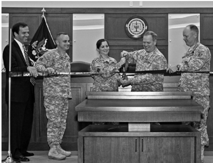
Suffolk Construction celebrates ribbon-cutting for BRAC 132 USALSA Army administrative facility.

Suffolk Construction recently joined military and local dignitaries to celebrate the ribbon cutting of the BRAC 132 U.S. Army Legal Services Agency (USALSA) Administrative Building , a multi-story, 97,300 square-foot Command Headquarters Building located in Fort Belvoir, Va. Partnering with architect Perkins+Will ; mechanical subcontractor Southland Industries ;