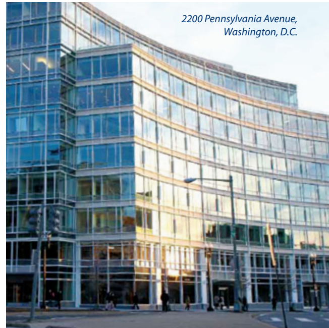
2200 Pennsylvania Avenue, Washington, D.C.

8 hours that are provided in the lease to the actual hours that people are working in the building, with additional hours provided as needed.