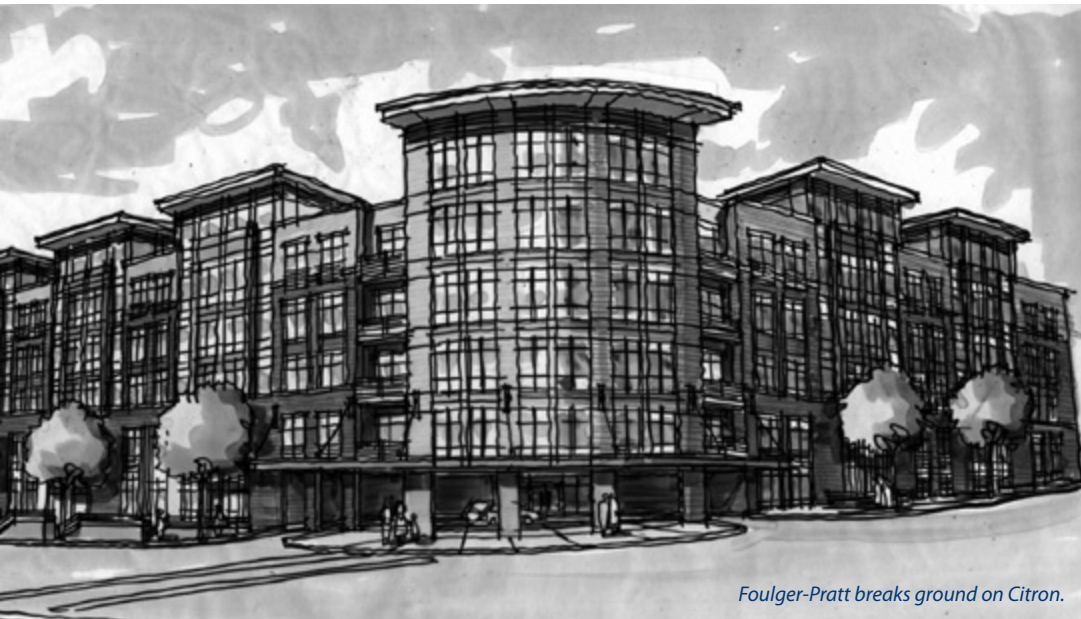
Foulger-Pratt breaks ground on Citron.

The U.S. Army Corps of Engineers-Baltimore District has awarded Grunley/Goel Joint Venture, LLC , a joint venture between Grunley Construction Co., Inc. and Goel Services, Inc., a $7.5 million contract to expand Fort Detrick's Education Center by 18,000 square feet and construct a new 10,000 square-foot community auditorium within Building 1520. Two buildings will also be demolished, and site restoration performed. The project will seek LEED certification.