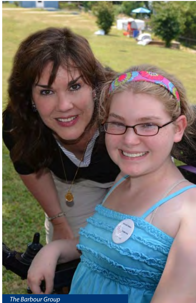
The Barbour Group

December: Dozens of gifts were donated to residents of Patrick Henry Shelter House through a holiday wish list program and the company holiday party raffle raised $2,057 for Shelter House. Balfour Beatty volunteers helped with Shelter House's Annual Holiday party, facilitating games, gift distribution and food service for the residents, and finally made a $10,000 year-end donation to Shelter House.