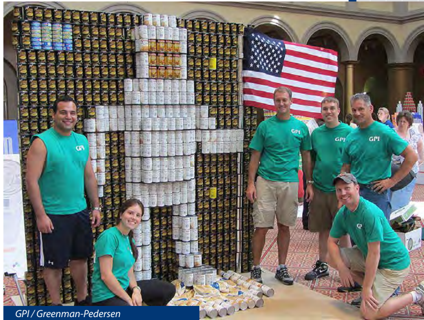
GPI / Greenman-Pedersen