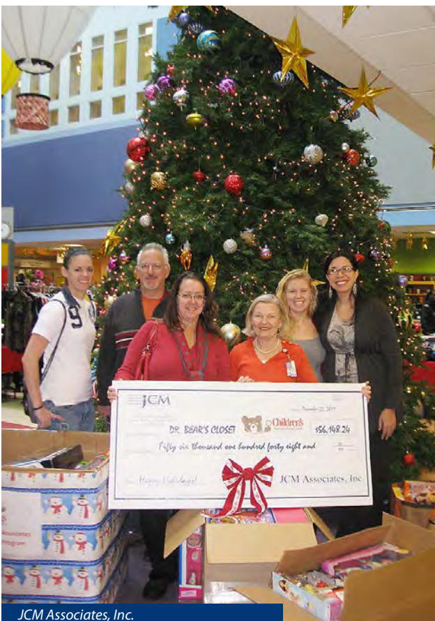
JCM Associates, Inc.

Dr. Bear’s Closet is a program that helps to boost the spirits of patients and their families by providing fun activities that include toys, games, books, and portable computers. Dr. Bear’s Closet also provides housing for out of town families in financial need. A well-stocked Dr. Bear’s Closet ensures that every patient has a gift for holidays, birthdays and most importantly, a little something to serve as a reward for their courage in fighting an illness. In December, JCM delivered $57,000 in checks and toys to Dr. Bear’s Closet. The total raised in the first ten years is in excess of $314,000.