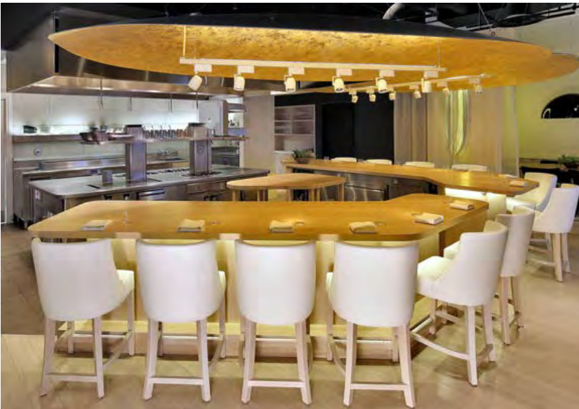
Top: KBR Building Group to Construct The Acadia, Mixed-Use High-Rise Residential Project, in Arlington, Va. Bottom: Forrester Completes Construction of minibar by José Andrés.

The first floor features a fitness center with private studio for personal training, mailroom, clubhouse, business center with café, and private conference room for residents. The two-tier building provides a swim-deck on the seventh floor featuring an infinity-edge pool with saltwater system, barbecue area, club kitchen, shower rooms and massage room. The 19 th floor offers a penthouse clubroom with an open demonstration kitchen to accommodate large groups, as well as an outdoor barbecue area, seating and views of Arlington and the D.C. skyline. The three below-grade parking levels include a pet grooming room, bike storage and bike workrooms where residents can fix their bikes. The Acadia's dog-friendly park is connected to the adjacent The Millennium and The Gramercy, creating a fluid connection for all of Metropolitan Park buildings. Public art pieces will also be featured in the parks in an effort to support the artists. Building materials consist of a granite and limestone skin and incorporates an enhanced acoustical package for the whole building. The first floor consists of 16,350 square-foot retail.